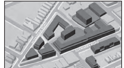
Plans for the block between Illawarra Rd & Petersham Rd

The Greens think some increase in density is good. However, the proposed planning policy gives away too much to developers and will lead to overdevelopment that will destroy the village feel and character of our urban centres.